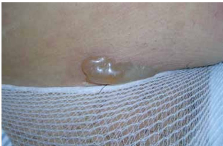
As the disease progresses, bullous lesions tend to develop.

tality in the offspring has been noted. 5 The disease tends to recur in future pregnancies.