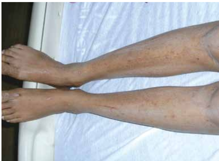
FIGURE 3 Intrahepatic cholestasis of pregnancy

ICP lacks primary lesions. Shown here are the secondary erythema and excoriations that results from scratching the intense pruritus.