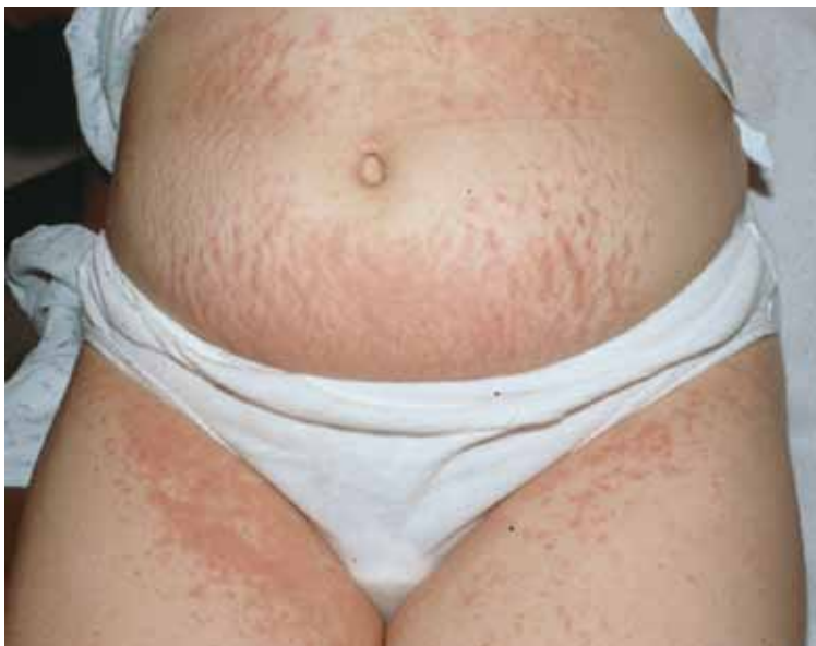
The itchy, red papules of PUPP often coalesce into plaques.