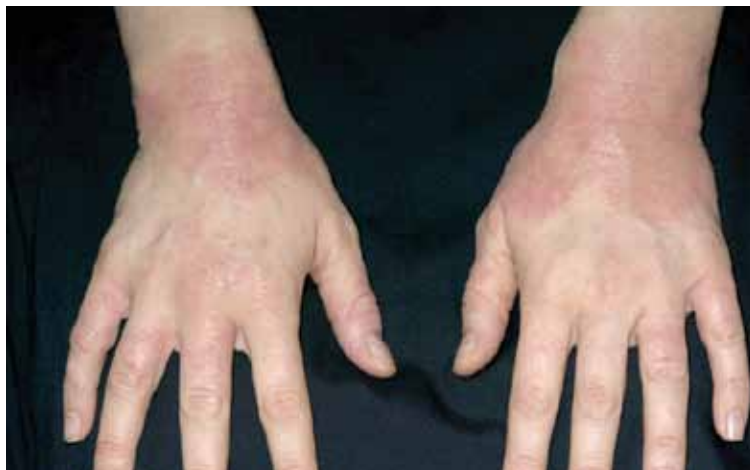
EP/PP typically manifests as grouped, crusted, erythematous papules, patches, and plaques, often with excoriations.