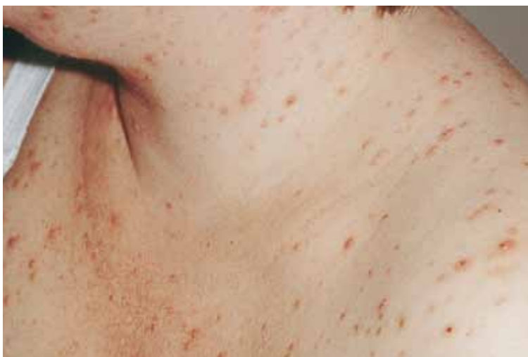
The papules and pustules of PFP are concentrated around hair follicles.